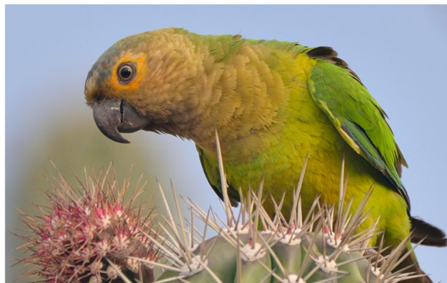
(Brown-throated Parakeet / Endemic subsp.