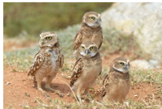
(Shaco’s / Aruba Burrowing Owls)

Because of my small groups, the pace of the tour is “how you like it.” We can do intensive birding, keep a relaxed pace, or even a little of both. Each of my tours is tailored to the wishes of the participants. And even though the focus is birding, I never ignore the cultural, scenic and other features of Aruba.